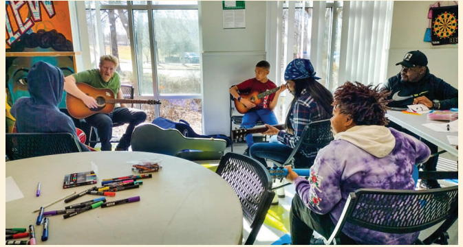
Guerilla Poets (top and below) — a local arts nonprofit that offers workshops at the Mecklenburg County Detention Center for detainees — was one of 33 local arts and culture groups to receive an Opportunity Fund grant.