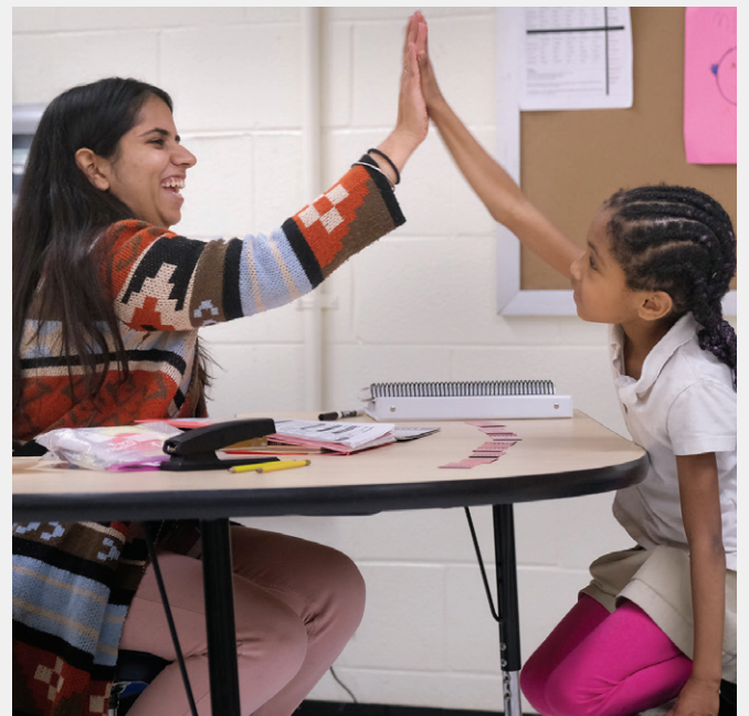
The Augustine Literacy Project received a $10,000 grant from CMCF to recruit and train volunteers who will tutor more than 300 aspiring readers.

For a complete list of grants: CharMeck-cf.org