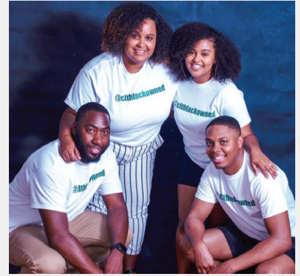
CLT Black Owned calls itself a "social good company" that supports Black-owned businesses. The group received a grant in the first round of the Beyond Open CLT grant program.