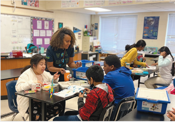
As a recipient of the CMCF social capital grant, Digi-Bridge pairs mentors from local companies with students to spark interest in STEAM (science, technology, engineering, arts and math).