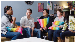
The Plus Collective grantee Time Out Youth has been a safe haven for LGBTQ+ youth for years. Find out more: PhilanthropyFocus.org/TOY .

Time Out Youth offers support, advocacy and opportunities for personal development to LGBTQ+ teens. An operating grant from The Plus Collective will help sustain their mission to support lesbian, gay, bisexual, transgender, queer and questioning youth. The organization offers vital programs, fosters unconditional acceptance, and creates safe spaces for self-expression through leadership, community support and advocacy.