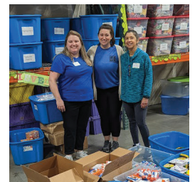
In January, fundholders volunteered with Freedom School Partners, a nonprofit focused on summer literacy and enrichment for under-resourced students.

Visit fftc.org/UpcomingEvents or email nonprofits@fftc.org for upcoming opportunities