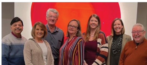
FFTC's technology team was recognized for presenting a series of webinars on digital transformation, business analytics and project management.

FFTC Information Technology team: Technology Association of Grantmakers' Community Leadership Award