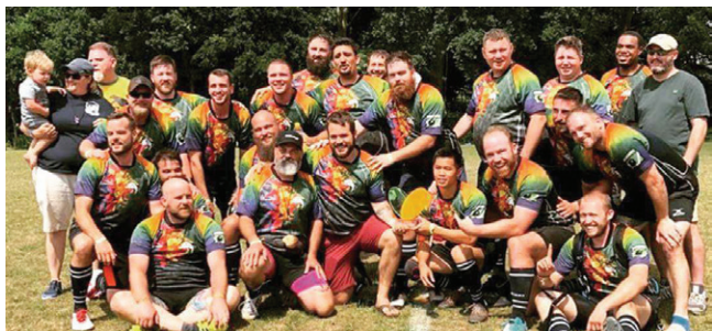
The Charlotte Royals Rugby Football Club was awarded $5,500 from The Plus Collective, an FFTC collective giving program, for general operating support.

For more information: ThePlusCollective.org