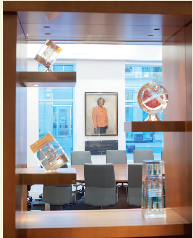
The Garmon-Brown Board Room will be complimentary for local nonprofits to use during weekday business hours starting this summer.