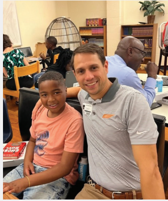
A Rocket Mortgage employee mentors a student with Big Brothers Big Sisters of Central Carolinas.