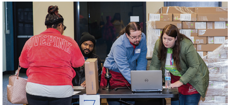
Volunteers help narrow the digital divide by distributing laptops to local residents.