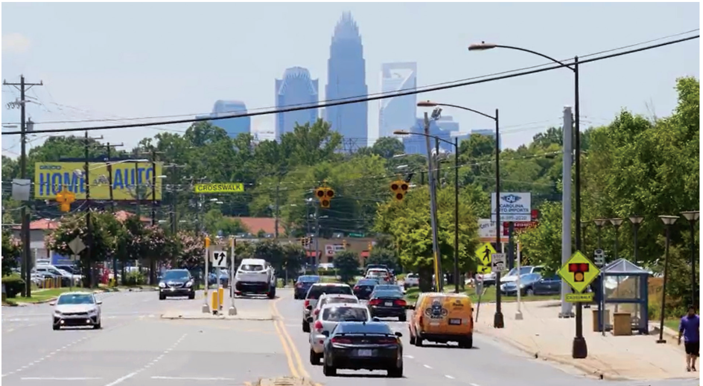
To invest in the City's Corridors of Opportunity, the Mayor's Racial Equity Initiative contributed $1 million to help buy two hotels. The goal: increase housing, decrease crime.