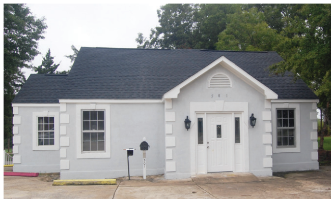
A $2,500 grant to United Way of Lancaster County from LCCF will help provide hygiene kits to the county's first homeless shelter.