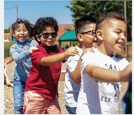
Children play at Charlotte Bilingual Preschool, a recent CMCF grant recipient.