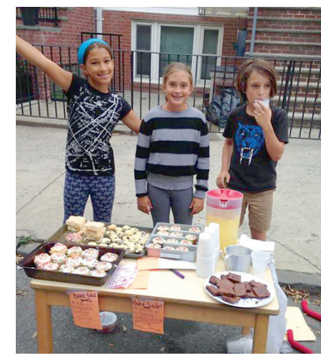
Gifts to the Hurricane Florence Response Fund came from many places, including these kids who donated funds from a bake sale they held in Brooklyn, N.Y.