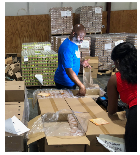
Harvest Hope Food Bank received a $25,000 grant for food aid from the Hurricane Florence Response Fund.