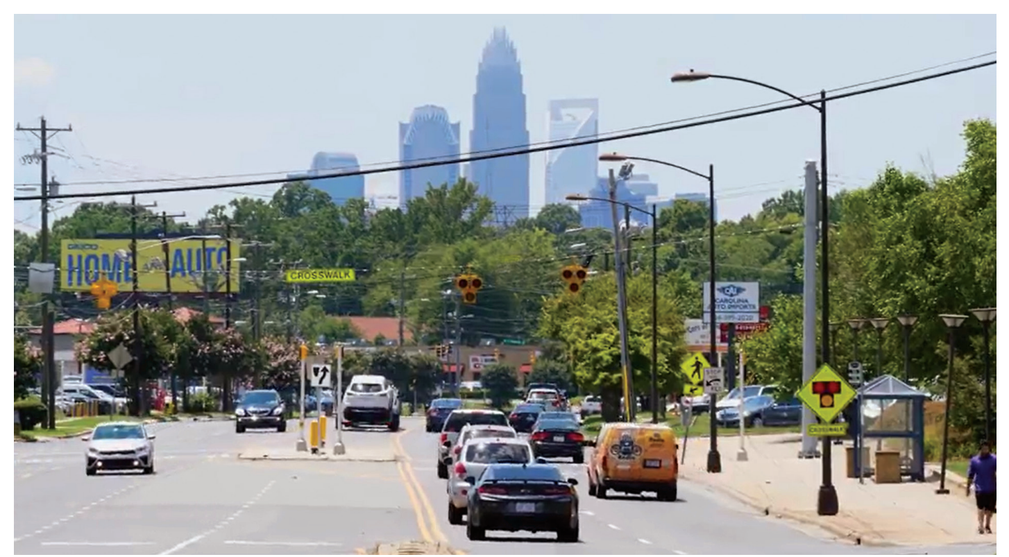
To invest in the City's Corridors of Opportunity, the Mayor's Racial Equity Initiative contributed $1 million to help buy two hotels. The goal: increase housing, decrease crime.