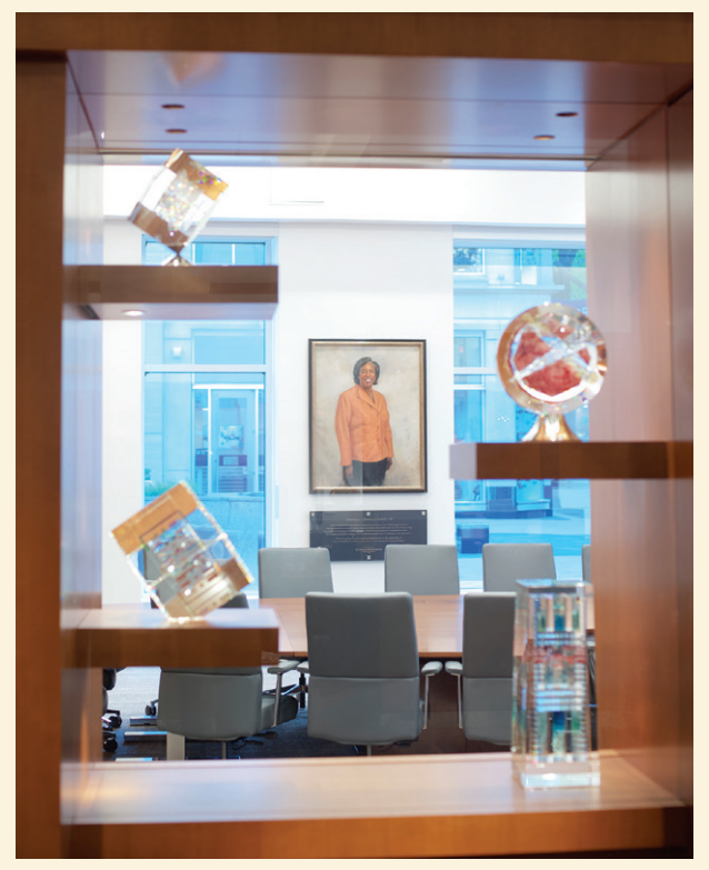
The Garmon-Brown Board Room will be complimentary for local nonprofits to use during weekday business hours starting this summer.