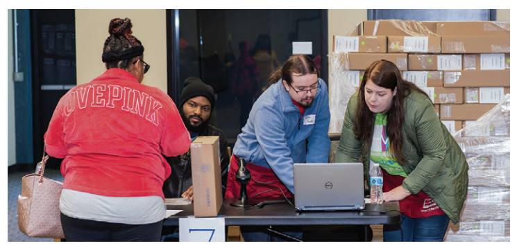
Volunteers help narrow the digital divide by distributing laptops to local residents.