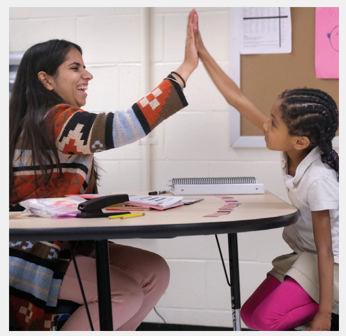
The Augustine Literacy Project received a $10,000 grant from CMCF to recruit and train volunteers who will tutor more than 300 aspiring readers.