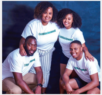
CLT Black Owned calls itself a "social good company" that supports Black-owned businesses. The group received a grant in the first round of the Beyond Open CLT grant program.