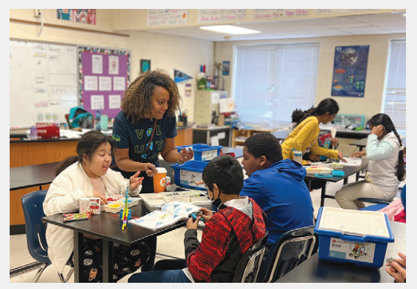
As a recipient of the CMCF social capital grant, Digi-Bridge pairs mentors from local companies with students to spark interest in STEAM (science, technology, engineering, arts and math).