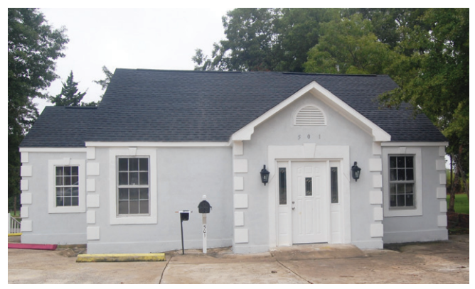
A $2,500 grant to United Way of Lancaster County from LCCF will help provide hygiene kits to the county's first homeless shelter.